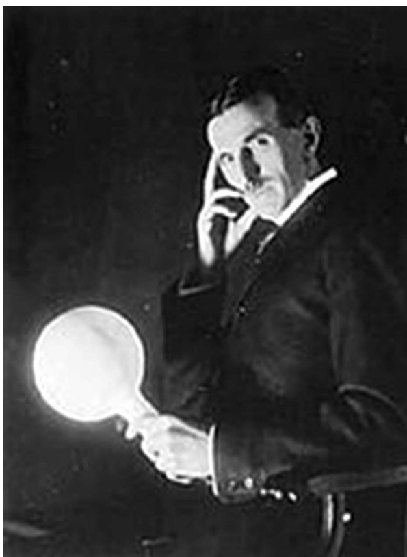
Figure 2. Tesla demonstrating wireless electricity transmission Tesla holding a light bulb illuminating it by hand, without any wire connections. Slika 2. Tesla demonstrira bežični prenos električne energije. U njegovoj ruci svetli sijalica bez direktnog povezivanja sa strujnim izvorom.

blished the article “Phenomena of alternating currents of very high frequency” in the journal Electrical World [3, 5, 8, 16]. It was also the first paper on high-frequency currents in the world [8]. According to Tesla, his accidental experience with high-frequency currents led to the following conclusions on the physiological effects of these currents on the human body: “The discharge of even a very large coil cannot produce seriously injurious effects, whereas, if the same coil were operated with a current of lower frequency, though the electromotive force would be much smaller, the discharge would be most certainly injurious. This result, however, is due in part to the high frequency. The writer’s experiences tend to show that the higher the frequency the greater the amount of electrical energy which may be passed through the body without serious discomfort” [16]. This was a shocking discovery that disproved Edison’s claims that alternating currents were dangerous and harmful [8, 16]. On the other hand, no one could foresee the amazing effects of high-frequency currents [8]. Tesla’s explanation for this enigma was soon associated with the human body, emphasizing the following: “It seems certain that human tissues act as condensers” [5, 8].