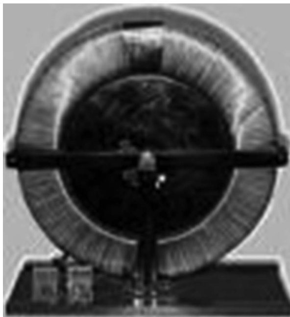
Figure 3. Tesla's famous electric motor (induction motor) constructed in 1887. It is the best machine for converting electrical energy into mechanical energy ever. A rotating magnetic field invented by Tesla in 1888, is a key principle in the operation of this "wheel of modern age". It is almost noiseless device with high efficiency (95 %).

All Tesla's inventions in physics and electrical engineering were the result of the kind of intuition that René Descartes described around 1628 in his philosophical work "Rules for the Direction of the Natural Intelligence" (Latin - Regulae ad Directionem ingenii ) [7, 30]. Attempting to explain intuition as precisely as possible, Descartes defined it as an innate light of reason (Latin - Ratione luce , French - Innée lumière ) [30]. Tesla was closest to Descartes ideal in his fundamental discoveries in the field of electromagnetism and related technologies [7]. In 1904, in "Note on Cabanellas Patent, No. 164995" Tesla wrote about his inventive talent: "From time to time, in rare intervals, Great Spirit of discovery comes to the Earth to announce a secret that should improve humanity. It selects the best prepared and most honorable one, and whispers a secret to his ear. Valuable knowledge comes like a flash of light. When he understands its hidden meaning, he is happy to see a miraculous change: a new world appears in front of his eyes and he barely recognizes any similarity with the old one. This is not a passing illusion, a mere game of his playful imagination or a phantom of the mist that will disappear. The miracles he sees, although far in time, will happen. He knows that, with no shadow of doubt in his mind, and feels it with every part of his body: It is a great idea" [5] ( Figure 4 ).