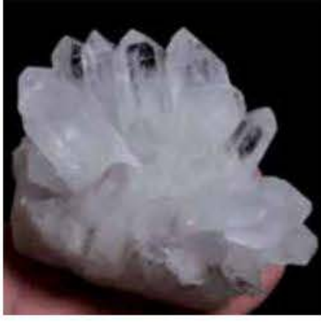
Figure 1: Quartz Cluster with Multiple Quartz Crystal Points on Matrix [2]. Quartz clusters can clear undesirable energies in a room (e.g., for protection), broadcast the energies of other stones or necklaces placed on them, or even clean the unwanted energies off of other stones or necklaces. The larger the cluster, the more impact it has on a

Quartz is SiO2 that crystalizes in the trigonal system, has a hardness of 7, and can come in a variety of colors [1]. This article concentrates on the colorless variety (Figure 1).