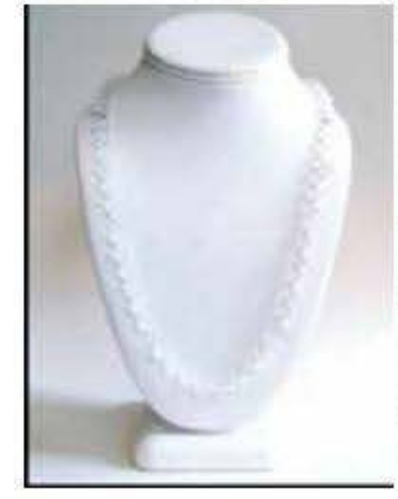
Figure 2: Therapeutic Quartz Necklaces. Top: from Gemisphere [7], a pure frosted quartz necklace. Bottom: from GEMFormulas [6], a quartz necklace with predominantly frosted beads, but containing six beads of clear optical quartz as a symbiotic.

My experience with quartz is that it helps to brighten my day and keep my heart happy. It provides a steady energy to help get me through my day. Quartz has proven useful for dealing with sudden skeletal injuries too; e.g., when my mother sprained her wrist wrapping a quartz necklace around her wrist helped to reduce the pain and swelling. I have experienced significant benefits from both kinds of quartz necklaces pic-